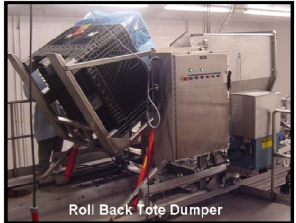
Roll Back Tote Dumper

GIVE US A CALL FOR ALL OF YOUR TOTE DUMPER NEEDS.