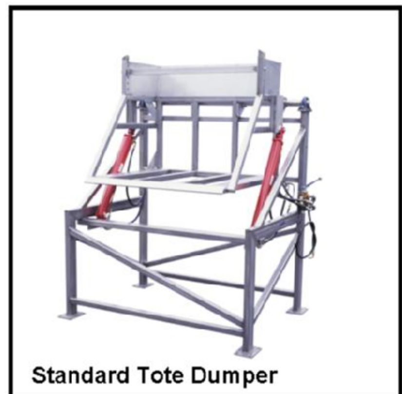
Standard Tote Dumper