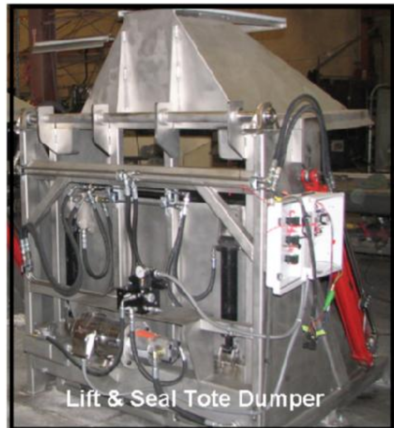
Lift & Seal Tote Dumper